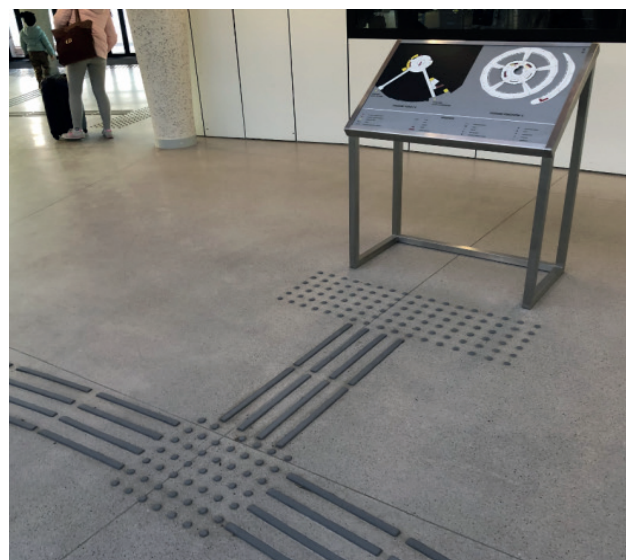
Fig. 30. Typhlographic board on the first floor hall