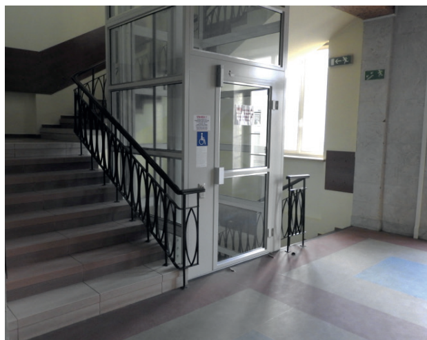
Fig. 10. Elevator from the side of Constitution Square, first floor