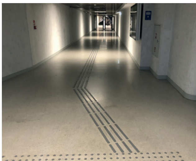
Fig. 23. Horizontal communication zone towards the hall and guidance paths