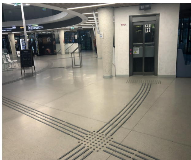
Fig. 32. Vertical communication in the hall-elevator