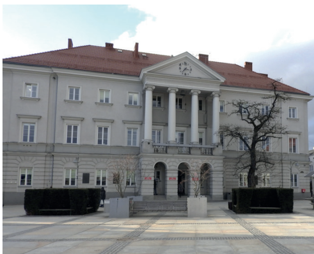
Fig. 1. View from the Kielce Market Square

The Kielce City Hall building has been adapted to the needs of people with disabilities to the maximum extent possible. Using the elevator from the side of Constitution Square requires calling an attendant, and from Leśna street – to travel dozen meters from the building entrance to the petitioner service area. The building's assets include legibility of the functional layout, spacious corridors, anti-slip surfaces. The difficulty may be to travel the distance from the entrance at Leśna street to the customer service centre.