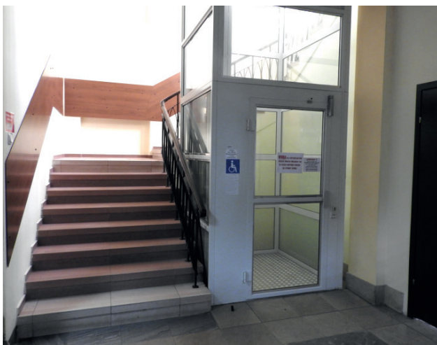
Fig. 9. Elevator from the side of Constitution Square, ground floor