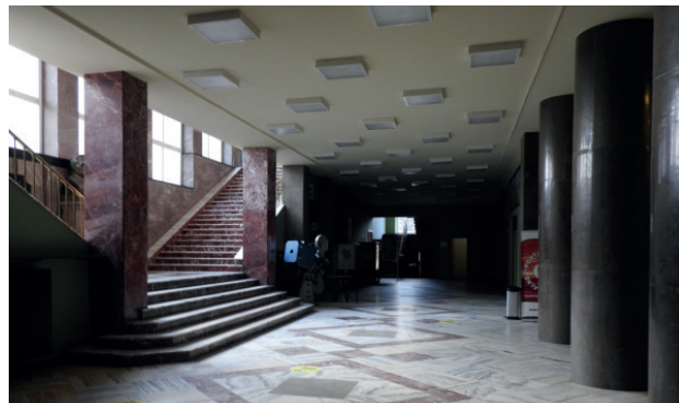
Fig. 16. Horizontal communication in the hall main building