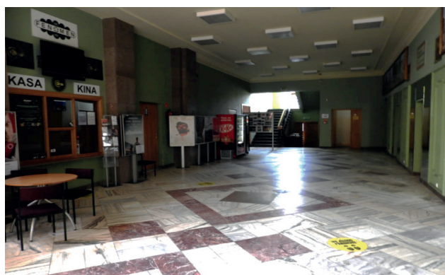
Fig. 17. Horizontal communication in the hall main building