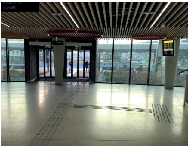
Fig. 25. Horizontal communication zone for platforms and paths leading to them