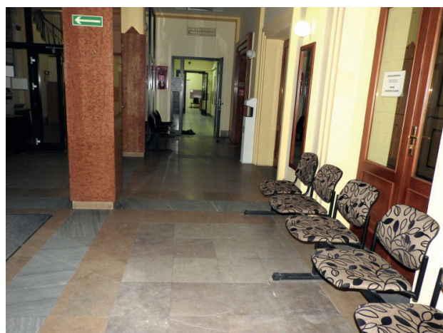
Fig. 8. Horizontal communication – ground floor from the side Constitution Square