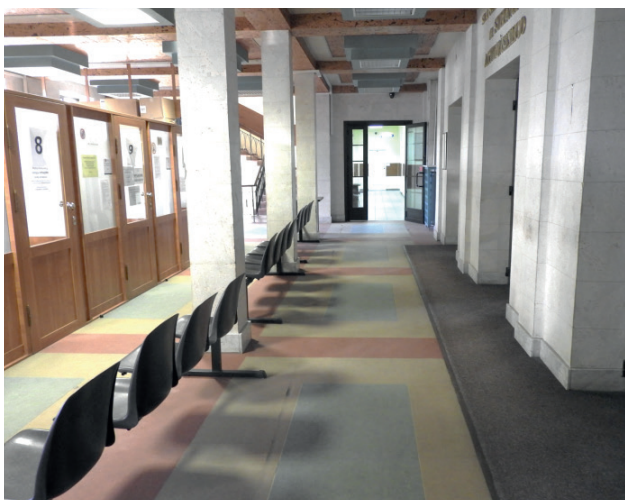
Fig. 11. Horizontal communication on the first floor in the City Hall