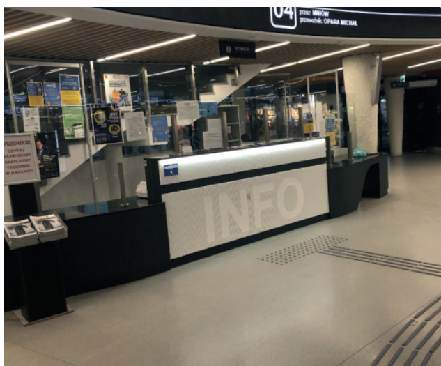
Fig. 31. Lowered console table in the service area Photographs: the author, February 2023