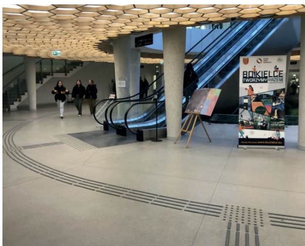
Fig. 27. Vertical communication zone – escalators and guide paths in the main hall