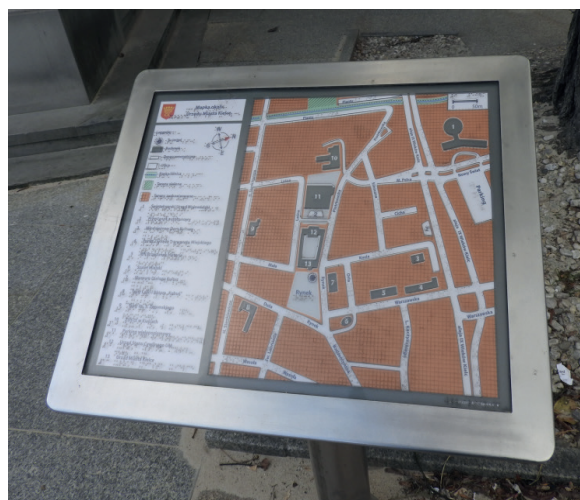
Fig. 6. A Braille board from the side of Market Square, board layout and details