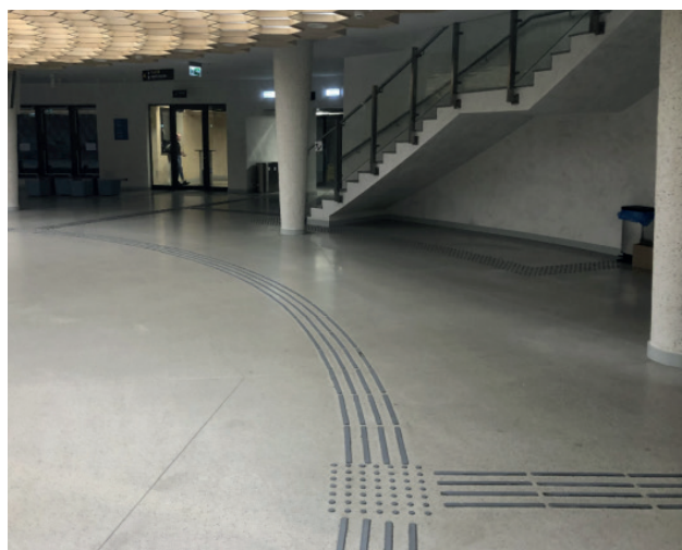
Fig. 28. Vertical communication zone – fixed stairs and guidance paths