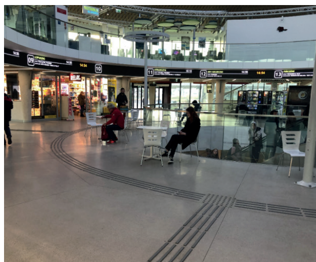
Fig. 24. Horizontal communication in the main hall of the building