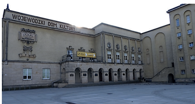
Fig. 13. View from the front side