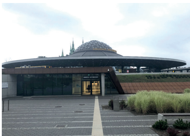
Fig. 21. Entrance to the bus station building

In the external space, parking spaces for people with disabilities have been designed, levels around the building have been leveled, ramps and accessible elevators have been prepared. The facility received a distinction in the 7th edition of the “Accessibility Leader” Architectural and Urban Competition (October 2022), the aim of which is to promote universal design and the best urban and architectural solutions in the field of adapting buildings and spaces to the needs of people with disabilities.