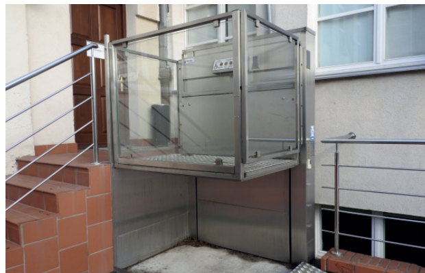
Fig. 20. Disabled platform at the back of the building