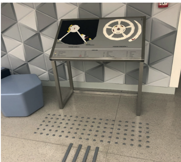
Fig. 29. Typhlographic board on the ground floor hall