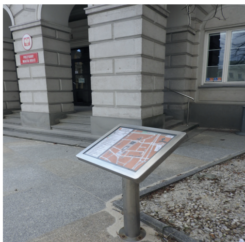
Fig. 5. A Braille board from the side of Market Square