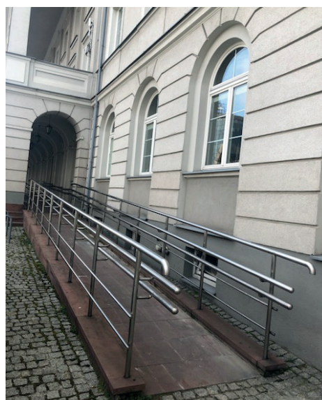
Fig. 4. Access zone for visitors from Constitution Square