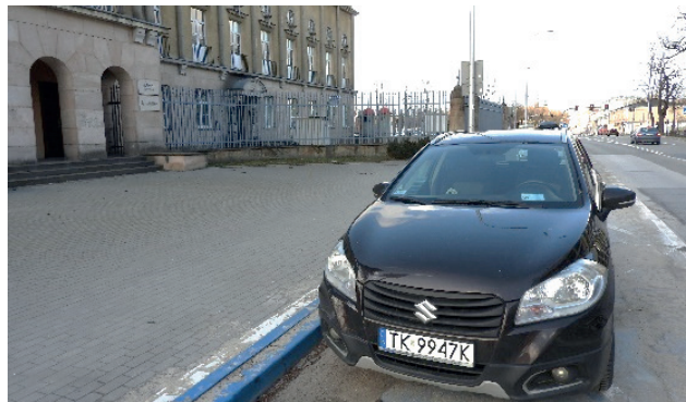
Fig. 15. Parking spaces for the disabled by the building