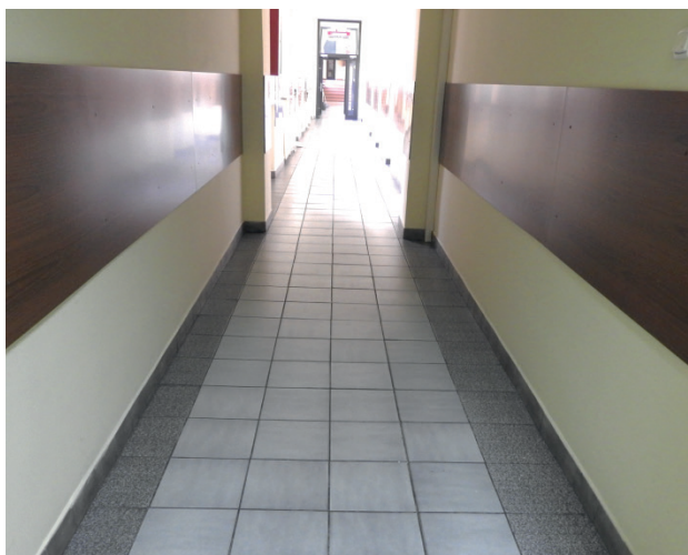
Fig. 12. Horizontal communication on the first floor in the City Hall