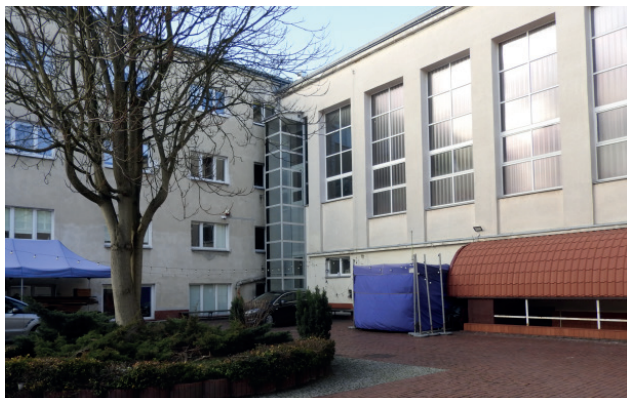
Fig. 19. Elevator for the disabled at the back of the building