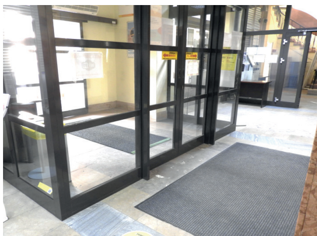
Fig. 7. Entrance from the side of Constitution Square