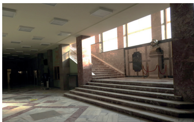
Fig. 18. Vertical communication in the main hall of the building