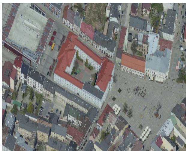
Fig. 2. Location of the City Hall building