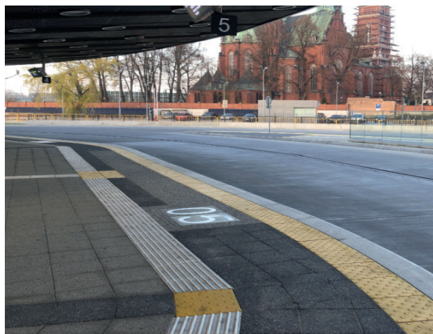
Fig. 26. Horizontal communication zone on the platforms