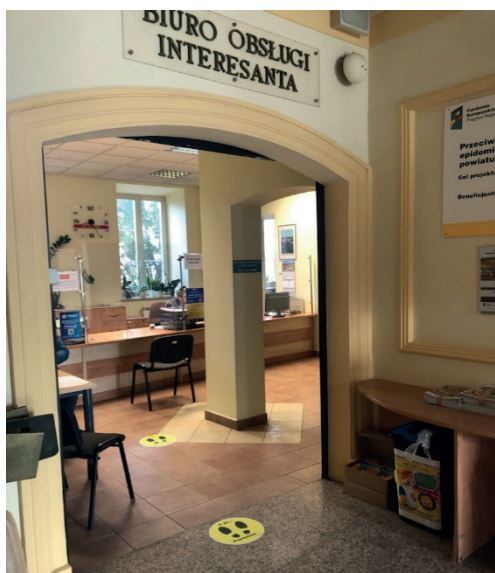
Fig. 3. Customer service zone from the side of the Market Square